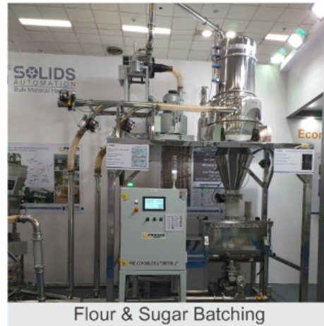
Flour & Sugar Batching