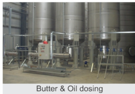
Butter & Oil dosing